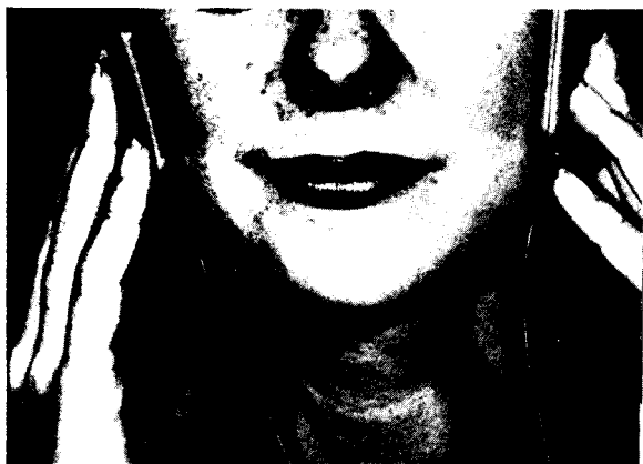
Fig. 1. External sponge pad electrodes placed bilaterally over subject's zygomatic arches.

evaluate their pain every 12 hours by marking the spot on the line they believed to best represent the pain they were experiencing at the time. The VAS score is the distance from the bottom of the line to the point of the subject's mark, measured to the nearest millimeter. Subjects were also instructed to make each evaluation independently from the previous ones by not consulting the previous VAS ratings. Subjects in both the 2- and 3-day treatment groups returned 24 hours later to repeat the treatment procedure. Subjects in the 3-day treatment group returned for an additional treatment 24 hours later. The subjects in the control group received no treatment procedures. Because each repeated factor is nested within the same treatment condition, the presence of absence of any electrical feeling from the TENS unit will not confound the experimental design.