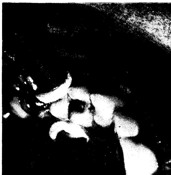
Fig. 2. Internal probe electrodes. One is placed on the crown of each tooth and the other on the palatal mucosa adjacent to the tooth.

The four-way repeated measures analysis of vari-